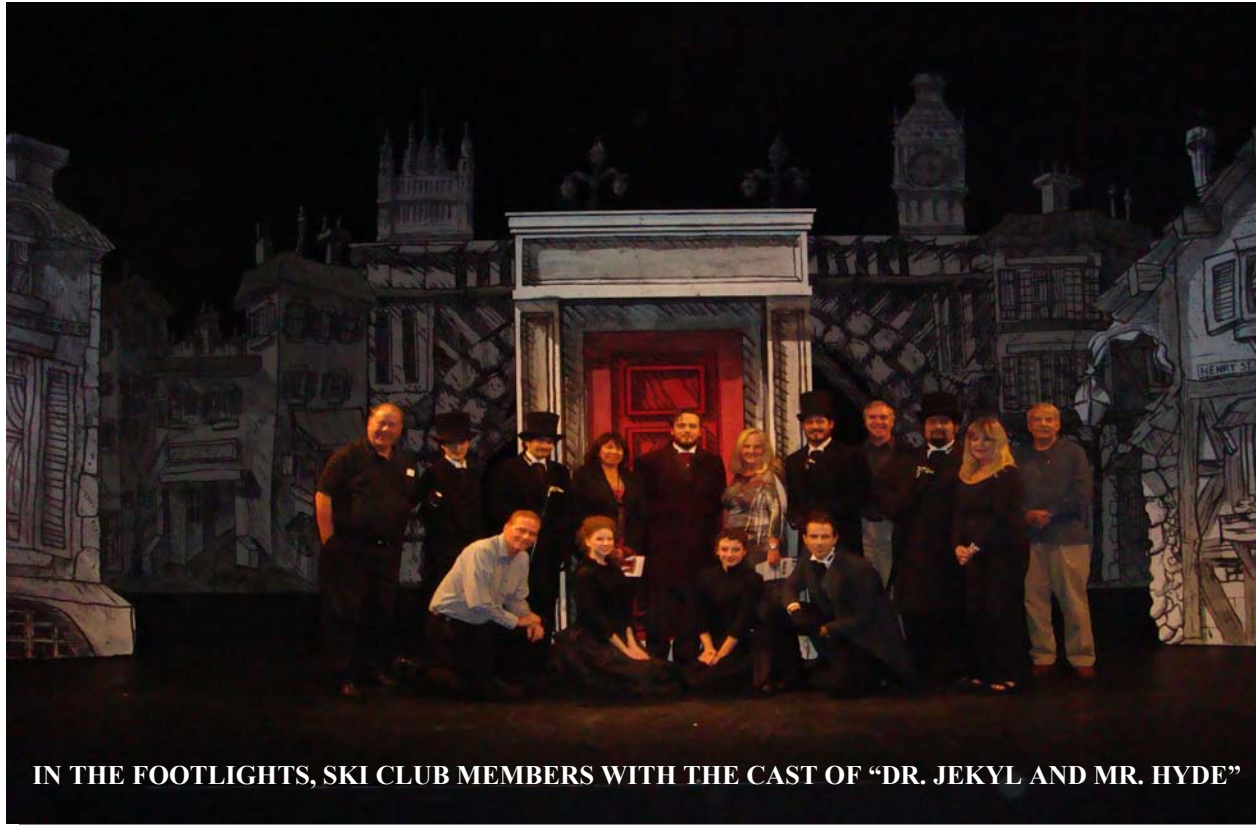
IN THE FOOTLIGHTS, SKI CLUB MEMBERS WITH THE CAST OF "DR. JEKYL AND MR. HYDE"