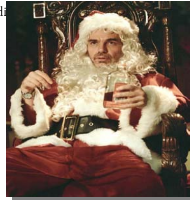
Billy Bob Thornton as “Bad Santa”

This has to be one of the ski clubs most anticipated, most fun, social events of the year !