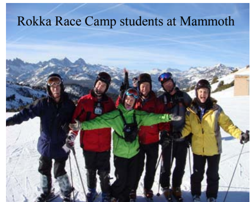
Rokka Race Camp students at Mammoth