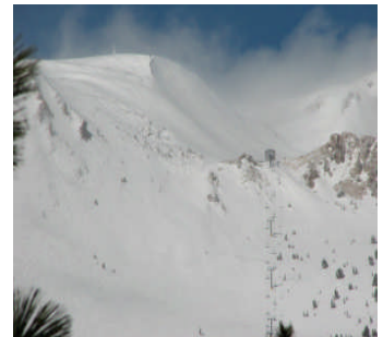
Dave's Run

WILL THERE BE SKIING ON INDEPENDENCE DAY ?